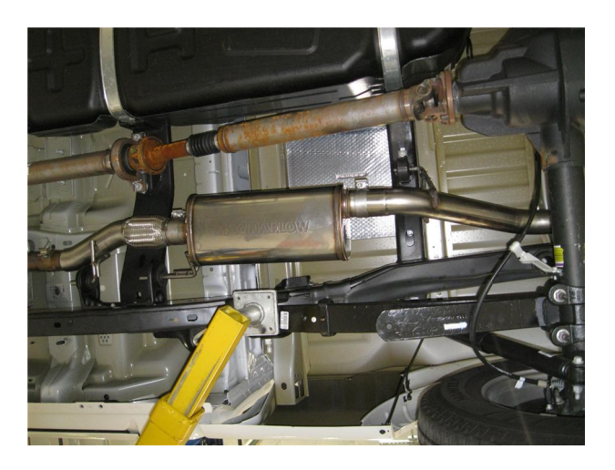
Step 2. To begin, fasten the Inlet Pipe Assembly to the catalytic converter using the OEM clamp assembly and by fitting the welded hanger into the OEM rubber insulator (Leave all clamps and fasteners loose for final adjustment of the complete system.) Install the Muffler to the Inlet Pipe Assembly using the supplied 3.00" clamp and fitting the hanger. Next install the Tailpipe Extension to the Muffler in the similar fashion using the supplied 3.00" clamp.