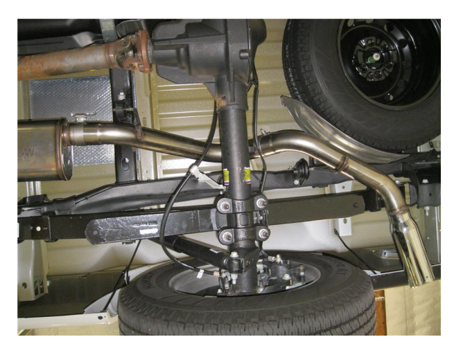
Step 3. Finish by installing the Tail Pipe Assembly to the Tail Pipe Extension using the supplied 3.00" clamp, fitting the welded hanger into rubber insulator.