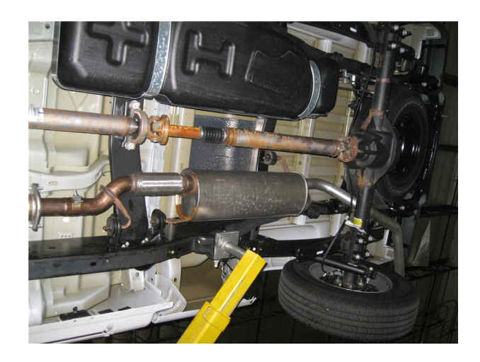
Step 1. To remove the OEM exhaust system, you will to need to cut the pipe beind the muffler before it goes over the axle. You can then disengage the welded hangers from the OEM rubber insulators and remove the tailpipe. Unfasten the clamp attaching the OEM muffler inlet to the OEM catalytic converter. Do not damage or discard the OEM fasteners or rubber insulators, as they will be reused to mount the new system. Disengage the muffler hangers and remove the OEM exhaust from the vehicle