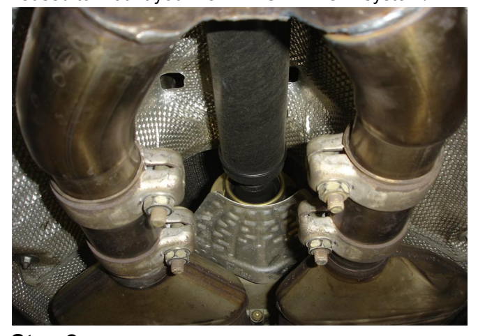
Step 2. Begin installation of your new exhaust system by inserting the inlet pipes of the X-Pipe Assembly into the two clamps at the catalytic converters locate the two welded hangers in the rubber insulators (leave all clamps loose for final adjustment of the complete system).