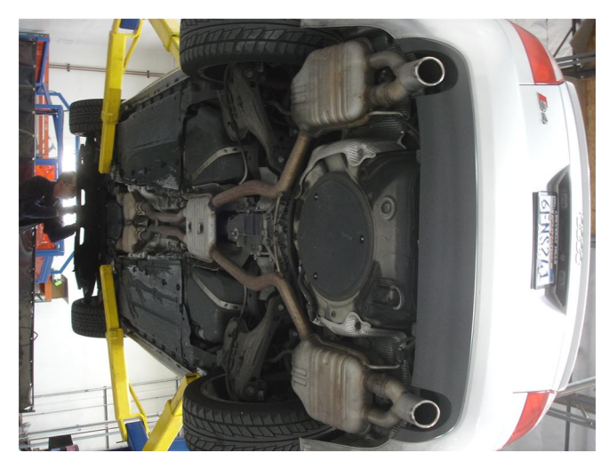
Step 1. Begin removal of the OEM system by loosening the two clamps attaching the inlet pipes to the catalytic converters. Working front to rear remove all mounting hardware and detach the welded hangers from the rubber insulators. Do not damage or discard the rubber insulators or fasteners, as they will be reused to mount your new MAGNAFLOW system.