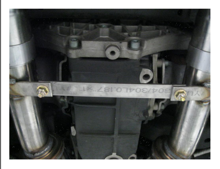
Step 3. Next Install the two Resonator and Muffler Assemblies in a similar fashion using the supplied 2.50" clamps and by fitting the welded hangers into the rubber insulators. Attach the supplied cross brace using the included hardware.