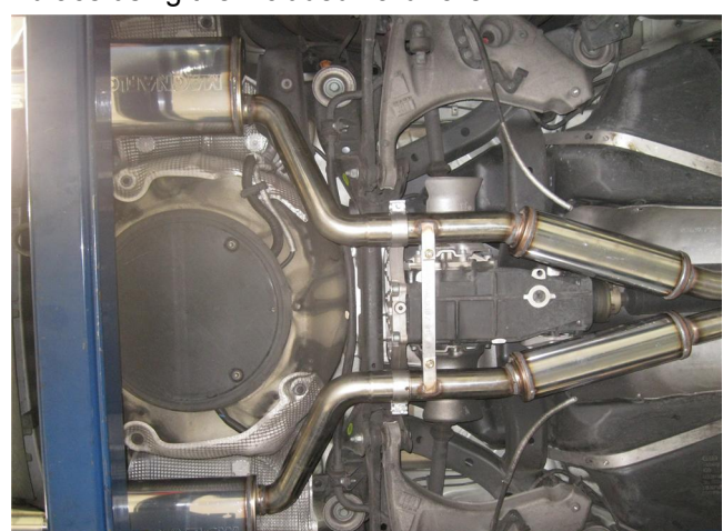
Step 4. Once a final position has been chosen for the new exhaust system, evenly tighten all clamps from front to rear using the torque specifications on page one of the instructions. Inspect all fasteners after 25-50 miles of operation and re-tighten if necessary.