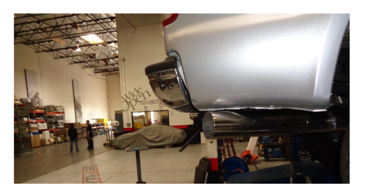
Step 6. Once a final position has been chosen for the new exhaust system, evenly tighten all clamps from front to rear using the torque specifications on page one of the instructions. Inspect all fasteners after 25-50 miles of operation and re-tighten if necessary.

MAGNAFLOW: 1901 Corporate Centre Drive - Oceanside, CA 92056 | 1(800) 990-0905 Technical Support: 1(800) 959-9226 | Email: moreinfo@magnaflow.com