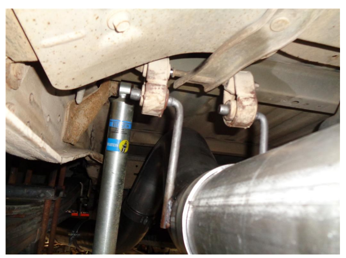
Step 4. Loosely install the Over Axle Pipe Assembly using the supplied clamps. locate both welded hangers to the rubber insulators.