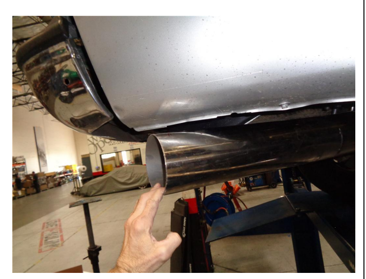
Step 5. Install the Tail Pipe Assembly in the same way. The Outlet may be trimmed as desired.