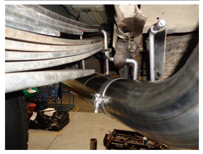
Step 3. As you assembly the Extension Pipes loosely locate the Hanger Clamp Assemblies as needed.

MAGNAFLOW: 1901 Corporate Centre Drive - Oceanside, CA 92056 | 1(800) 990-0905 Technical Support: 1(800) 959-9226 | Email: moreinfo@magnaflow.com