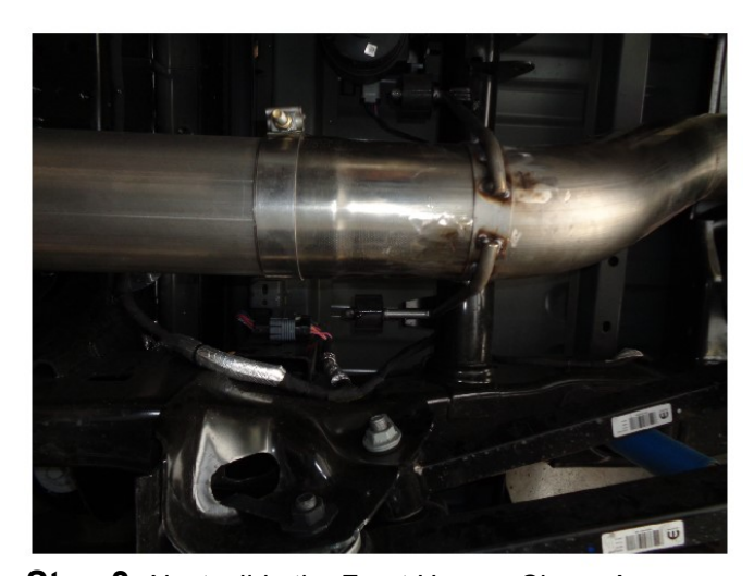
Step 3. Next, slide the Front Hanger Clamp Assy loosely onto the Over Axle Pipe Assy then attach Over Axle Pipe Assy to the Inlet Pipe using the supplied 5.00" Clamp. Engage the hangers into the rubber insulators. (Leave all clamp and fasteners loose for final adjustment of the complete system.)

MAGNAFLOW: 1901 Corporate Centre Dr - Oceanside, CA 92056 | 1(800)990-0905 Technical Support: 1(800) 959-9226 | Email: moreinfo@magnaflow.com