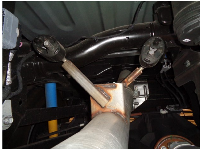
Step 1. Remove the OE system by unclamping the OE Extension and Tail Pipes from the junction behind the DPF. Disengage the welded hangers from the rubber insulators, working rearward finish removing the system. Do not damage or discard the rubber insulators as they will be reused to mount the new system.