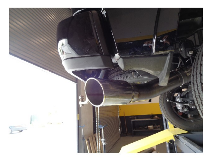
Step 5. Once a final position has been chosen for the new exhaust system, evenly tighten all clamps and fasteners, from front to rear, using the torque specifications on page one of the instructions. Inspect all fasteners after 25-50 miles of operation and re-tighten if necessary.