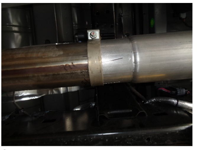
Step 2. Your vehicle configuration will determine which length of inlet pipe is used. See the table below for the cut point of the supplied extension pipe. The dimensions are the length of pipe you will need for your application. Begin installation of the MagnaFlow system by attaching the appropriate Inlet Pipe to the outlet of the DPF using the supplied 4.50" clamp.