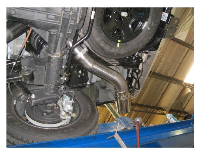
Step 4. Complete the installation by sliding the Rear Hanger Clamp Assy onto the Tailpipe Assy and attaching the Tailpipe Assy to the Over Axle Pipe. Engage the hangers into OE rubber insulators.