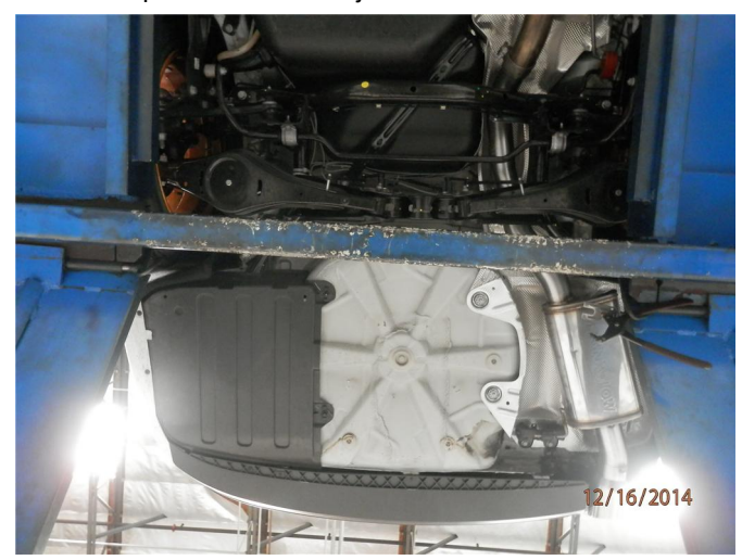
Step 4. Next attach the Muffler Assemby to the Resonator Assembly using the supplied 3.00" clamp and by fitting the hangers into the rubber insulators.