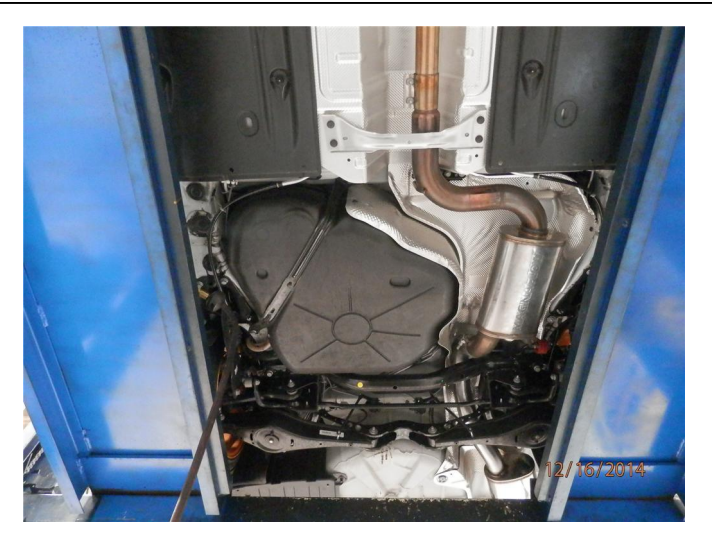
Step 3. Begin installing the new system by inserting the inlet of the Resonator Assembly into the clamp at the outlet of the OEM exhaust and fitting the hangers into the rubber insulators. Leave clamp loose for final adjustment.