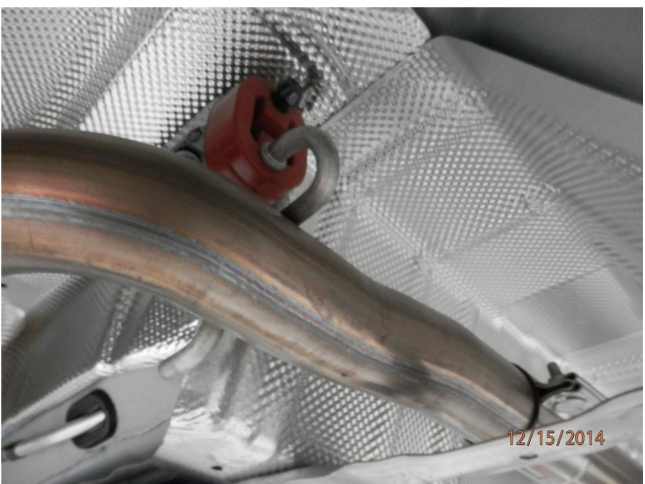
Step 2. Once cut, begin removing the exhaust by loosening the factory clamp located in front of the resonator. Working rearward extract the hangers from the rubber insulators (retain clamp and insulators as they will used in the installation of the new exhaust system). Remove the OEM system from the vehicle.