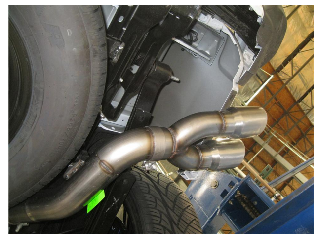
Step 4. Finish by installing the Tail Pipe Assembly to the Over Axle Assembly and Tip Assembly to the Over Axle using the supplied 3.50" clamps, fitting the welded hanger into rubber insulator.