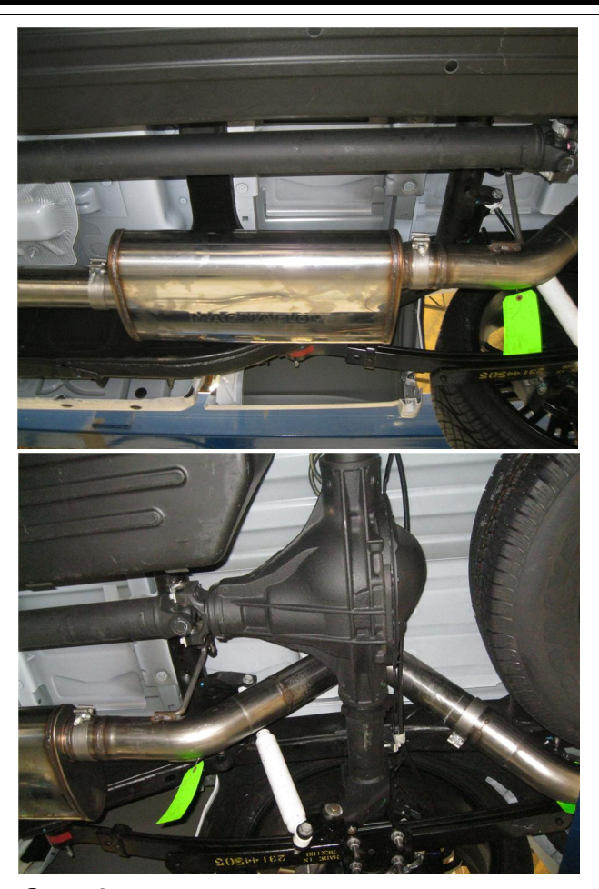
Step 3. Install the Muffler to the Inlet Pipe Assembly using the supplied 3.50" clamp. Next install the Over Axle Assembly to the Muffler in the similar fashion using the supplied 3.50" clamp, fitting the welded hangers into the rubber insulators.

Step 2. To begin, fasten the Inlet pipe assembly to the catalytic converter using the OEM clamp assembly and by fitting the welded hanger into the OEM rubber insulator (Leave all clamps and fasteners loose for final adjustment of the complete system.)