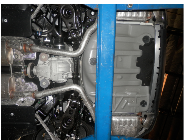
Step 1. To allow for removal of the OEM exhaust you will need to remove the underbody braces. Begin the removal of the OEM system by unfastening the X-Pipe inlets at the factory clamp locations. Next unfasten the two bolt flange behind the driver side muffler.Un-clip the ground strap from the passenger side hanger and working rearward (with the exhaust supported) extract the hangers from the rubber insulators and remove the OEM exhaust. Do not discard or damage the rubber insulators as they will be used to install the new exhaust system.