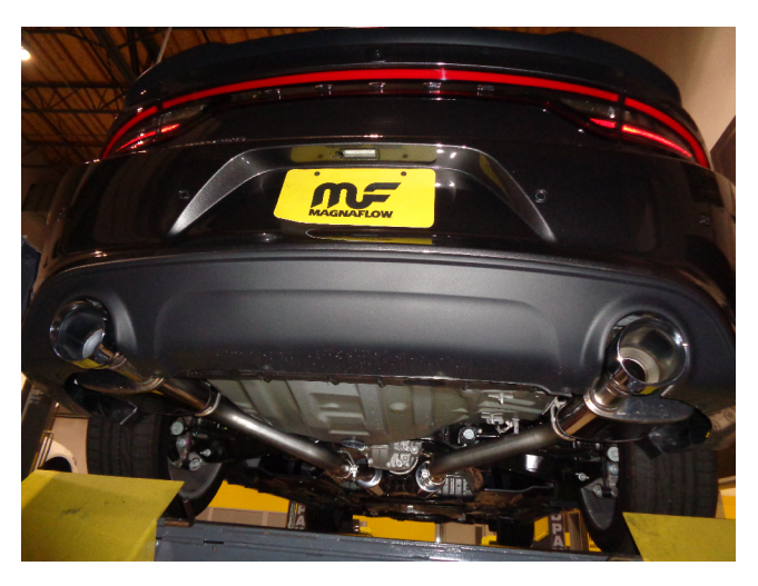
Step 4. Once a final position has been chosen for the new exhaust system, evenly tighten all clamps from front to rear using the torque specifications on page one of the instructions. Inspect all fasteners after 25-50 miles of operation and re-tighten if necessary.