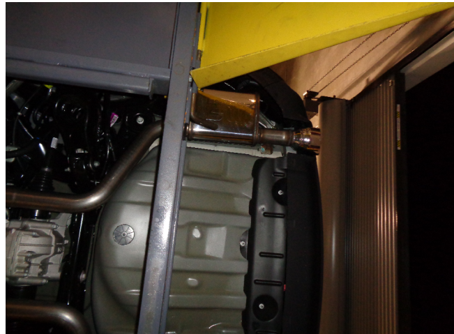
Step 3. Attach the Muffler Assemblies to the Resonator Assembly with supplied 2.50 Clamps and aligning them with the openings in the rear valance. Fit hangers into rubber insulators. Remember to reattach the ground strap to the hanger. Finish the installation by mounting underbody braces.