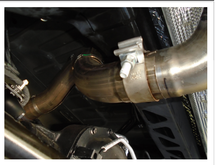
Step 3. Next install the OE clamp onto the Muffler Assembly insert the inlet to the OEM mid pipe outlet. Keep the clamp loose until final installation is complete.