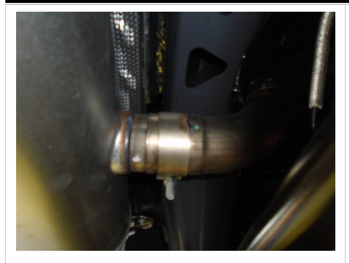
Step 1. Remove the OEM muffler assembly by first loosening the clamp attaching the muffler inlet to the midpipe. Disengage the two welded hangers from the rubber insulators. The muffler assembly may now be removed.