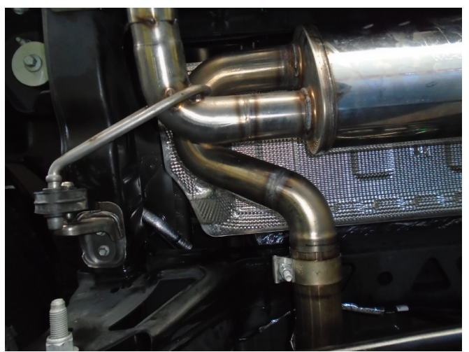
Step 4. Finish by engaging both welded hangers to the rubber insulators.

MAGNAFLOW: 1901 Corporate Centre Dr - Oceanside, CA 92056 | 1(800)990-0905 Technical Support: 1(800) 959-9226 | Email: moreinfo@magnaflow.com