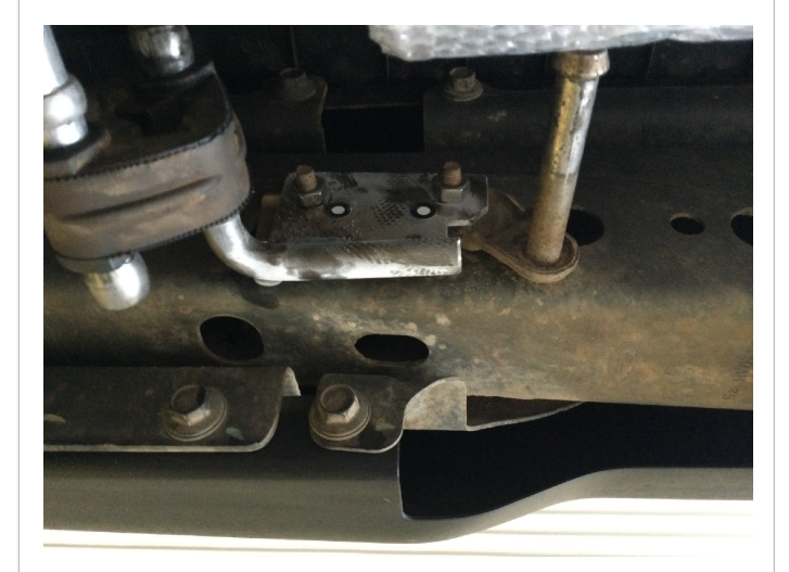
Step 2. Begin installing your new Axle Back system by mounting the supplied Hanger Bracket OVER the OEM hanger and fasten using the supplied M8 nuts.