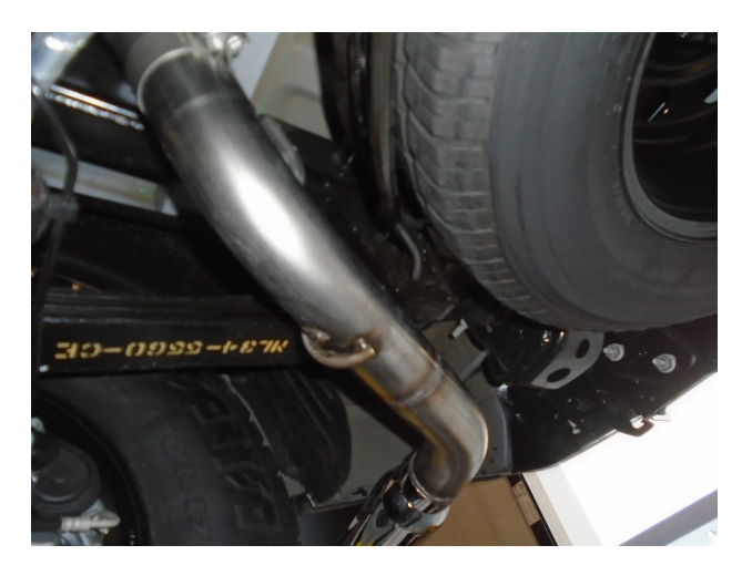
Step 5. Finish installing the components by sliding the Tailpipe Assembly onto the Over Axle Pipe and fastening with a supplied 3.00" Clamp. Fit the hanger into the rubber insulator.