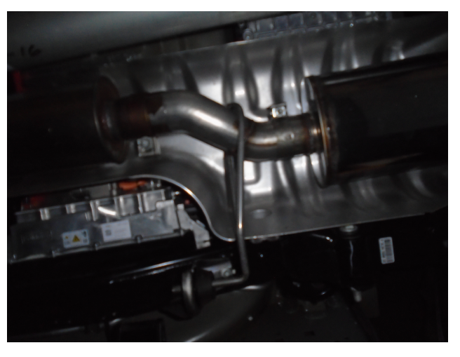
Step 2. Begin installing the new system by attaching the Inlet Pipe Assembly to the OE resonator outlet using the existing clamp. Locate the welded hanger to the rubber insulator. Leave all clamps and fasteners loose for final adjustment of the complete system once installed.