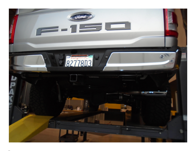
Step 6. Once a final position has been chosen for the new exhaust system, evenly tighten all clamps from front to rear using the torque specifications on page one of the instructions. Inspect all fasteners after 25-50 miles of operation and re-tighten if necessary.