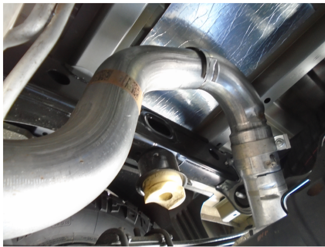
Step 1. To remove the OE exhaust system, loosen the clamp attaching the muffler to the resonator outlet pipe. With the system supported moving front to rear extract hangers from insulators. Do not discard the or damage the rubber insulators as they will be used to mount your new MAGNAFLOW system