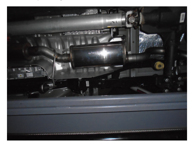
Step 3. Attach the Muffler Assembly to the Inlet Pipe Assembly with a supplied 3.00" clamp, fit the hanger into the rubber insualtor.