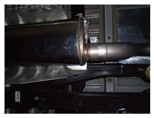
Step 4. Install the Over Axle Pipe using the supplied 3.00" clamp. Locate the welded hanger to the OEM rubber insulator.