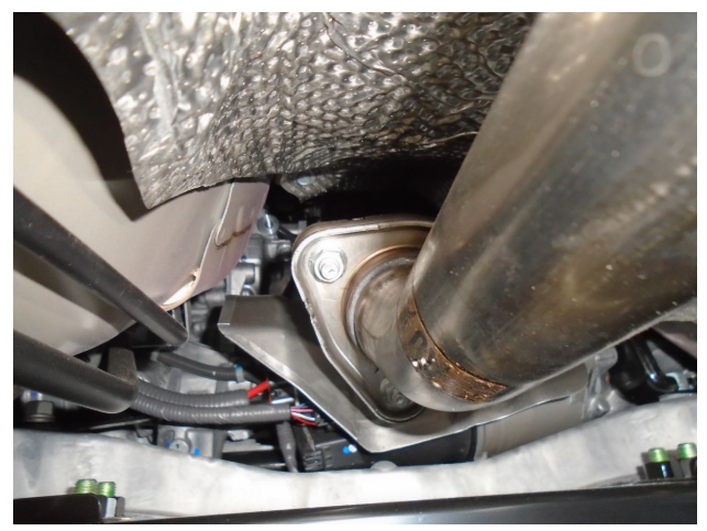
Step 1 . Begin removal of the OEM exhaust system by unbolting the inlet flange attaching the exhaust to the catalytic converter. Do not discard or damage the OEM fasteners or rubber insulators as they will be used to install the new system