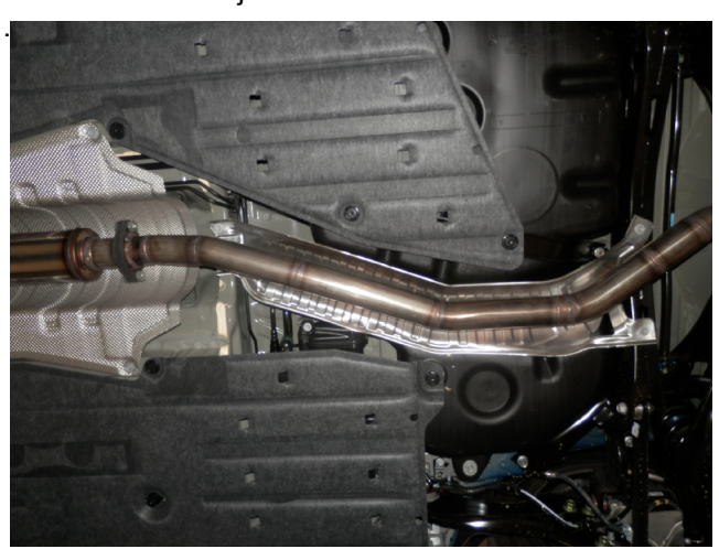
Step 4. Next attach the Mid-Pipe Assembly to the Inlet Resonator Assembly by fastening the flanges using the supplied gasket and hardware.

MAGNAFLOW: 1901 Corporate Centre Dr - Oceanside, CA 92056 | 1(800)990-0905 Technical Support: 1(800) 959-9226 | Email: moreinfo@magnaflow.com