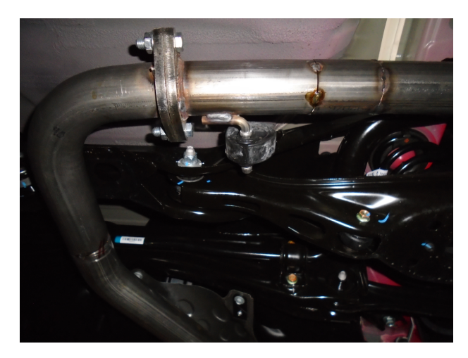
Step 5 : Loosely attach the Muffler Assembly flange to the Mid-Pipe Assembly. Secure with the supplied gaskets and hardware. Engage welded hangers to rubber insulators.