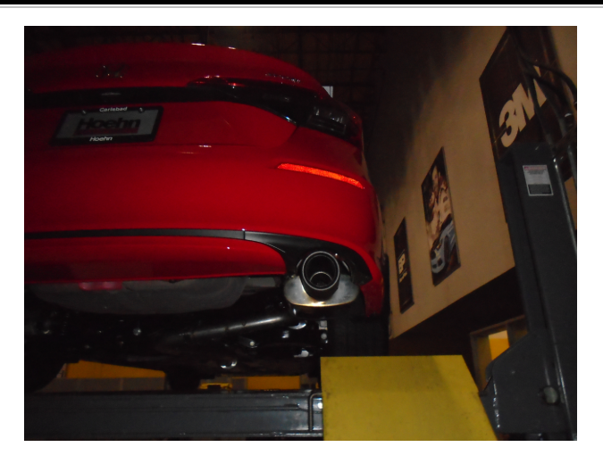
Step 6: Once a final position has been chosen for the new exhaust system, evenly tighten all clamps from front to rear using the torque specifications on page one of these instructions. Inspect all fasteners after 25-50 miles for operation and re-tighten if necessary.

MAGNAFLOW: 1901 Corporate Centre Dr - Oceanside, CA 92056 | 1(800)990-0905 Technical Support: 1(800) 959-9226 | Email: moreinfo@magnaflow.com