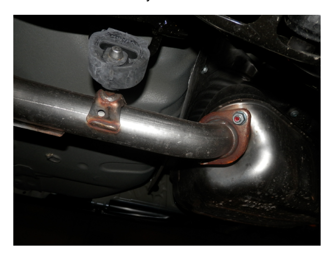
Step 2. With the system supported disengage all welded hangers from the rubber isolators. The OEM exhaust system may now be removed.