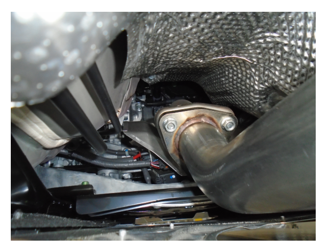
Step 3. Begin installation of your new MAGNAFLOW system by attaching the Inlet flange of the Inlet Resonator Assembly to the catalytic converter outlet using the OEM fasteners. Engage the welded hanger to the rubber isolator. Keep all fasteners and clamps loose until final adjustment.