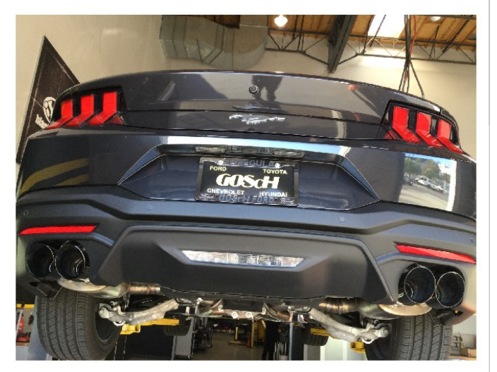
Step 7: Once a final position has been chosen for the new exhaust system, evenly tighten all clamps from front to rear using the torque specifications on page one of these instructions. Inspect all fasteners after 25-50 miles for operation and re-tighten if necessary.

MAGNAFLOW: 1901 Corporate Centre Dr - Oceanside, CA 92056 | 1(800)990-0905 Technical Support: 1(800) 959-9226 | Email: moreinfo@magnaflow.com