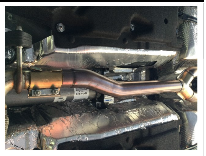
Step 3: Begin installation of the new system by loosely attaching the Y-Pipe Assembly to the catalytic converter outlet using the OEM clamps. Leave all clamps loose until final adjustment.