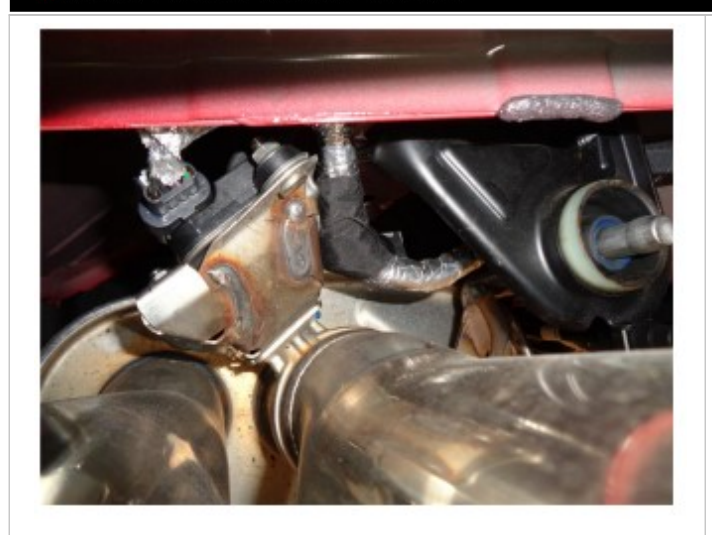
Step 1: Before removing the OEM exhaust system you will need to unplug the electrical connectors for both exhaust control valves. These are located on the vehicles tail pipes.