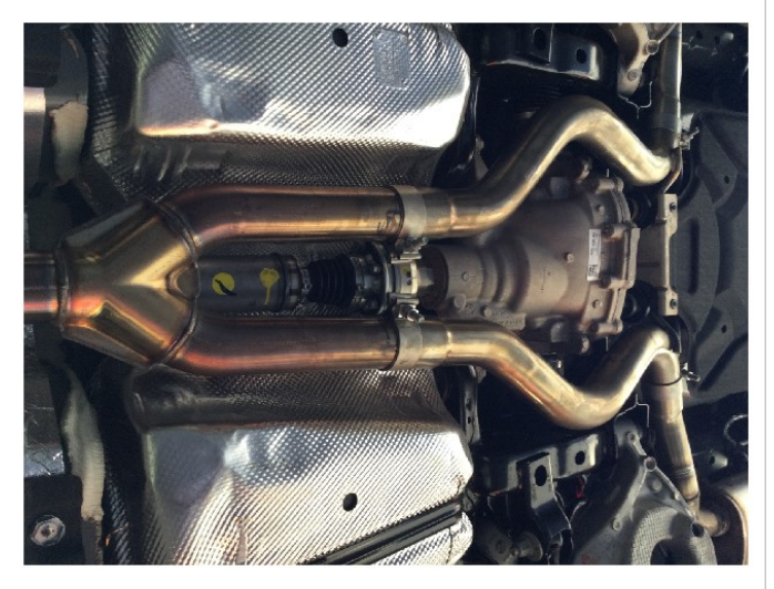
Step 4: Next attach both Mid Pipe Assemblies to the Y-Pipe Assembly using the supplied clamps. Locate the welded hangers to the rubber insulators.

MAGNAFLOW: 1901 Corporate Centre Dr - Oceanside, CA 92056 | 1(800)990-0905 Technical Support: 1(800) 959-9226 | Email: moreinfo@magnaflow.com