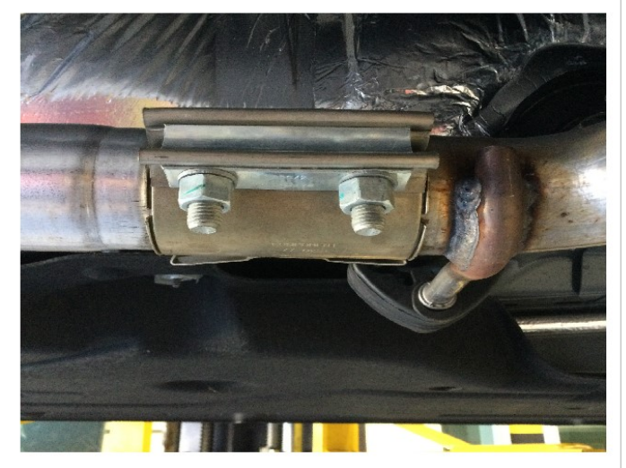
Step 2: Begin removing the OEM exhaust system by loosening the clamps located rearward of the catalytic converter. Next working front to rear extract the hangers from the rubber insulators and remove the OEM system. Retain insulators and clamps as they will be used to install the new system. Remove actuators from OEM exhaust valve and install on new rear muffler assemblies valves. Reuse OEM fasteners. replacement heat shields and springs are supplied.