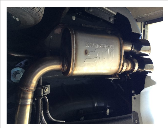
Step 5: Install the Muffler Assemblies to the Mid Pipe Assemblies using the supplied clamps. Locate the welded hangers to the rubber insulators.