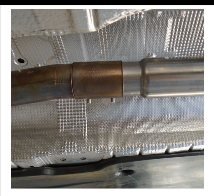
Step 3. Install your new system by first attaching the Inlet Assembly to the catalytic converter outlet. Lightly tighten the slip clamp to hold the component in place.

Step 2. Next, Disengage all welded hangers from the rubber insolators. The exhaust system can now be removed. Retain all fasteners and insulators as they will be needed to mount your new MAGNAFLOW system.